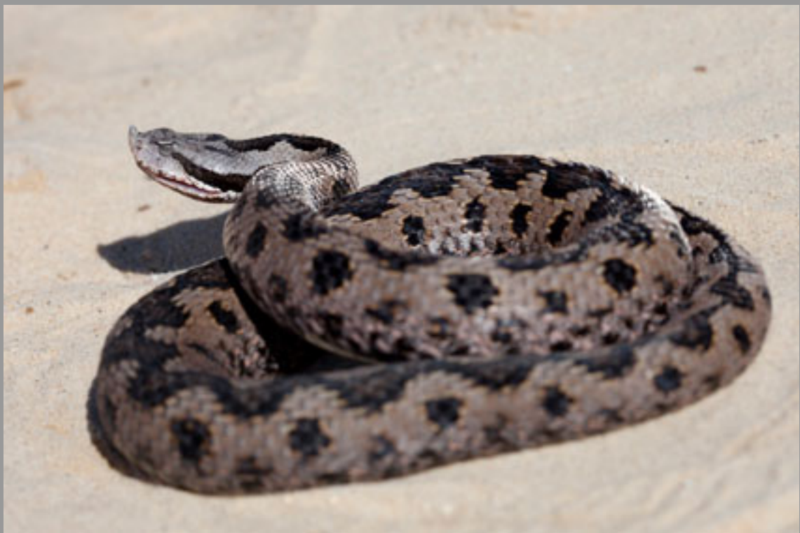
Vipera latastei gaditana , male