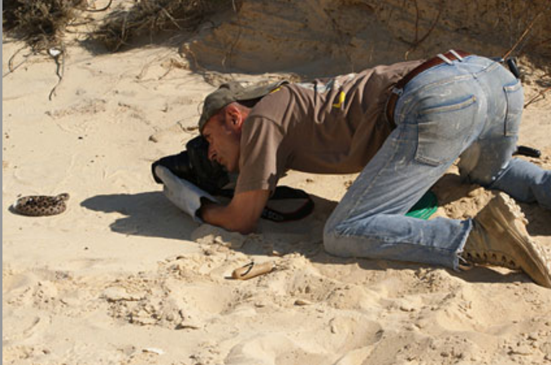
... me in action