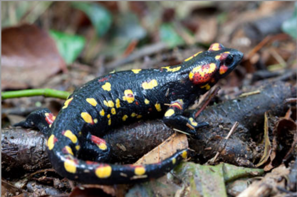
Salamandra salamandra morenica