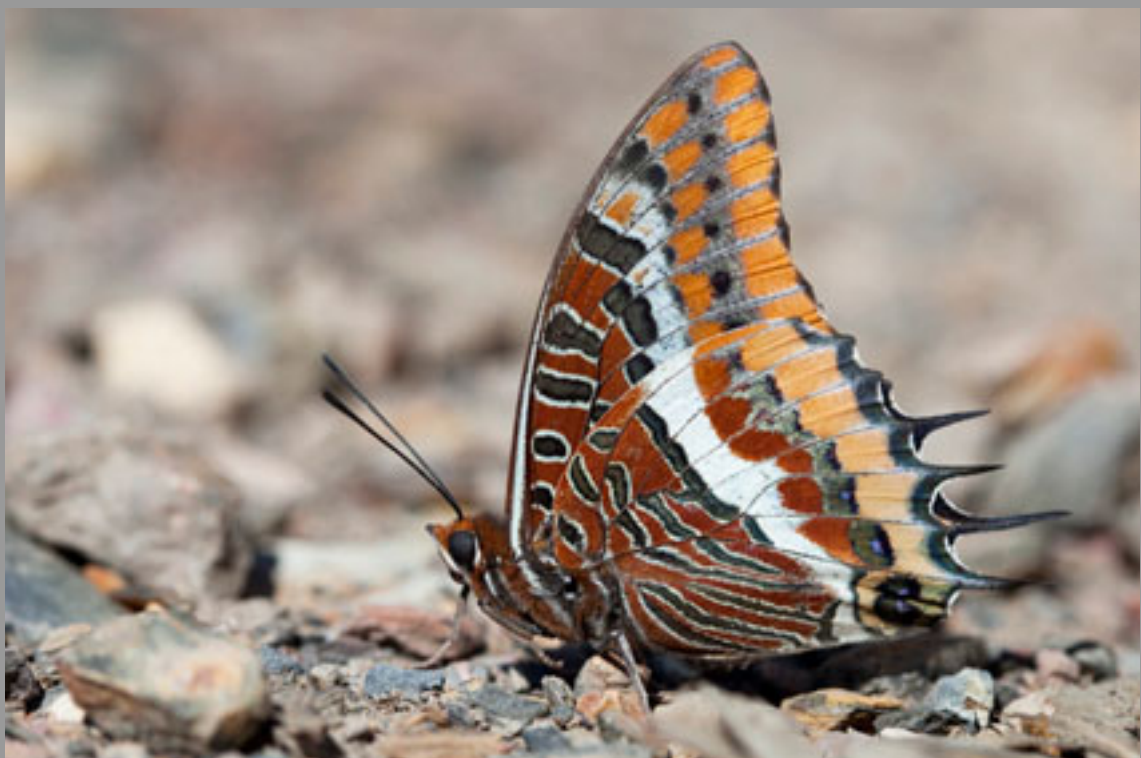
Charaxes jasius , male