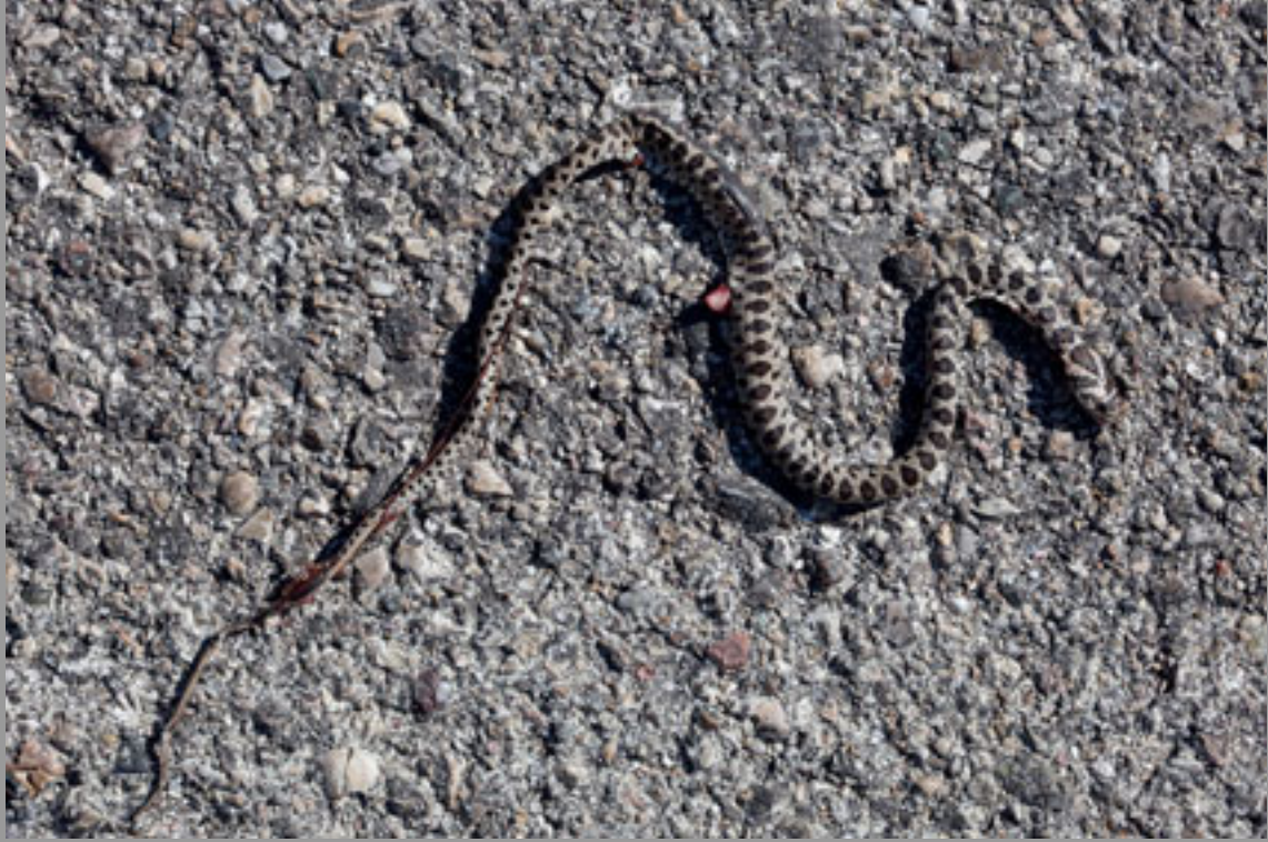
D.O.R. Hemorrhoidis hippocrepis , young