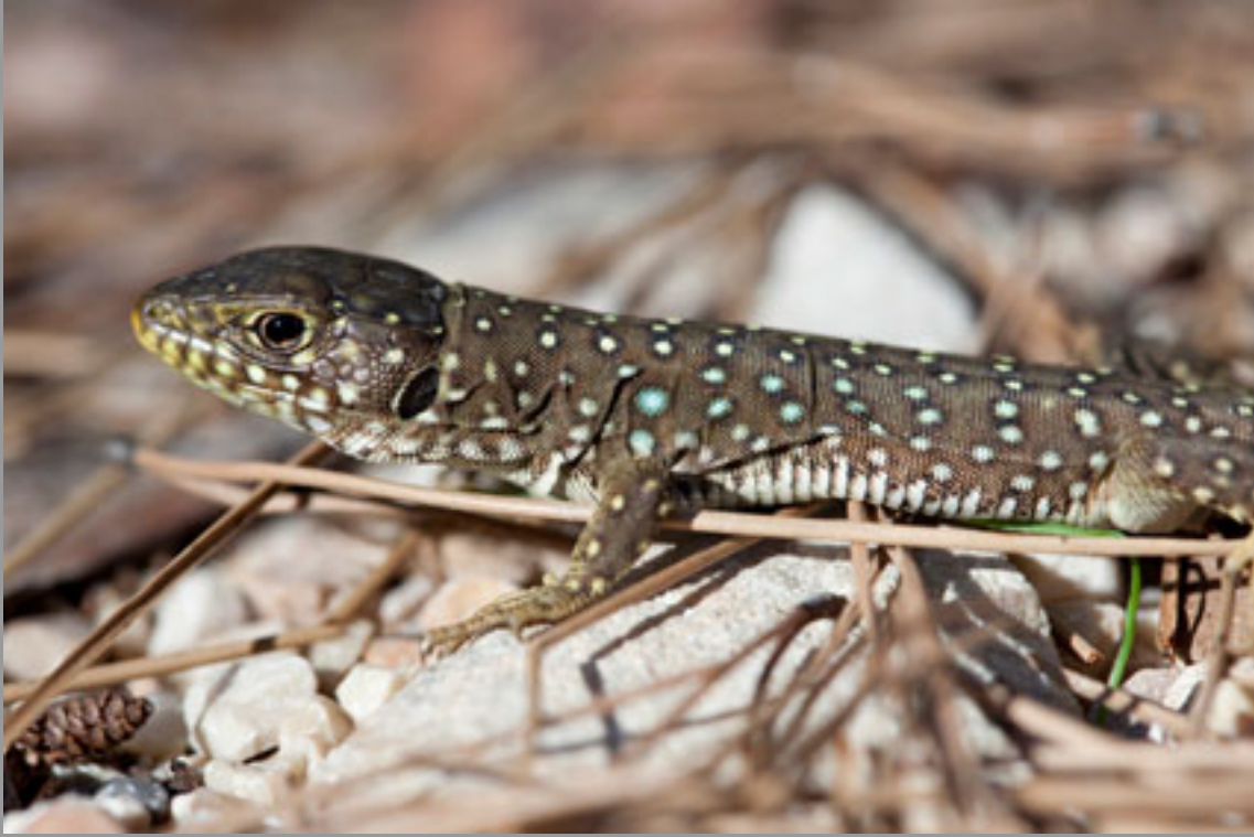
Timon lepidus , young

I spent only one day there, seeking Algyroides marchi , but without luck. I found : Discoglossus galganoi ( jeanneae ?), Alytes dickhilleni (adults and youngs) Podarcis virescens , Timon lepidus lepidus (juv.), a D.O.R. Rhinechis scalaris and a D.O.R. Hemorrhois hippocrepis . Next, a short unsuccessful stop at Puebla de Don Fadrique.