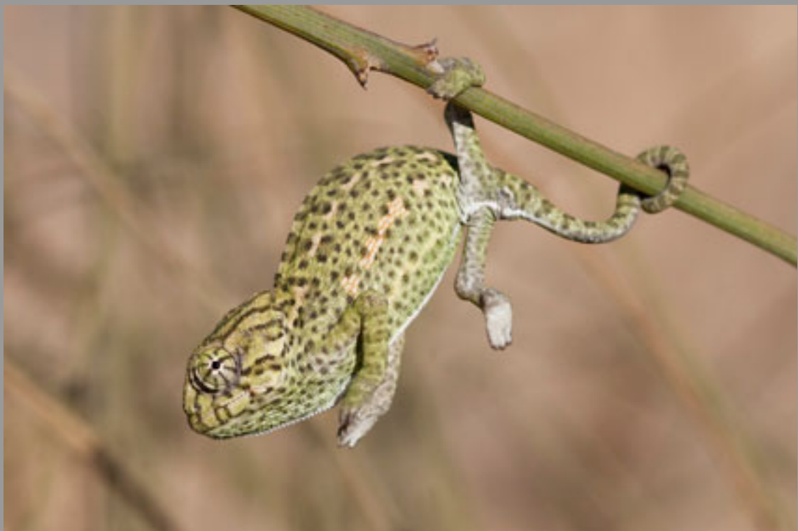
other acrobatic young