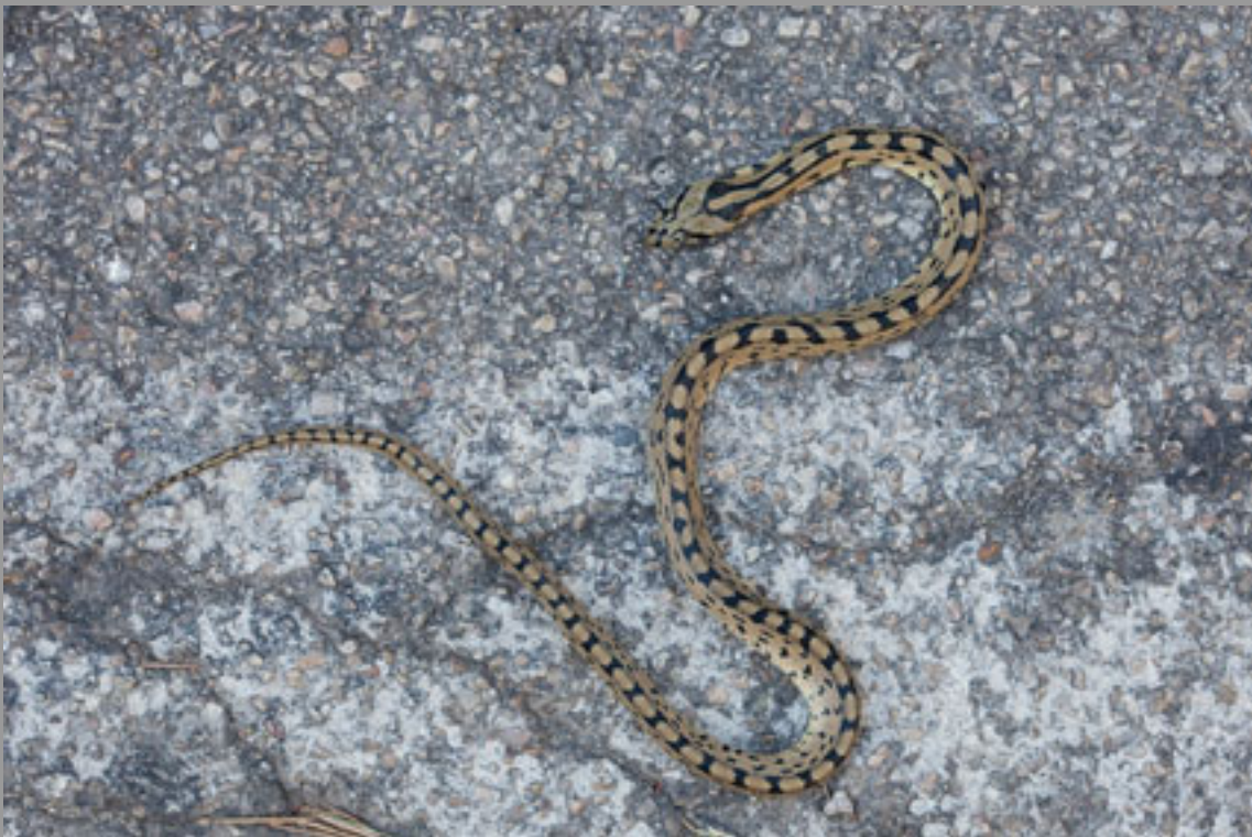
D.O.R. Rhinechis scalaris , young