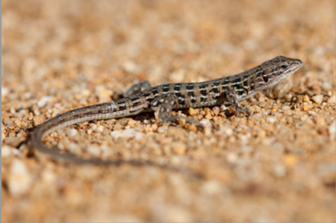
Psammodromus hispanicus hispanicus