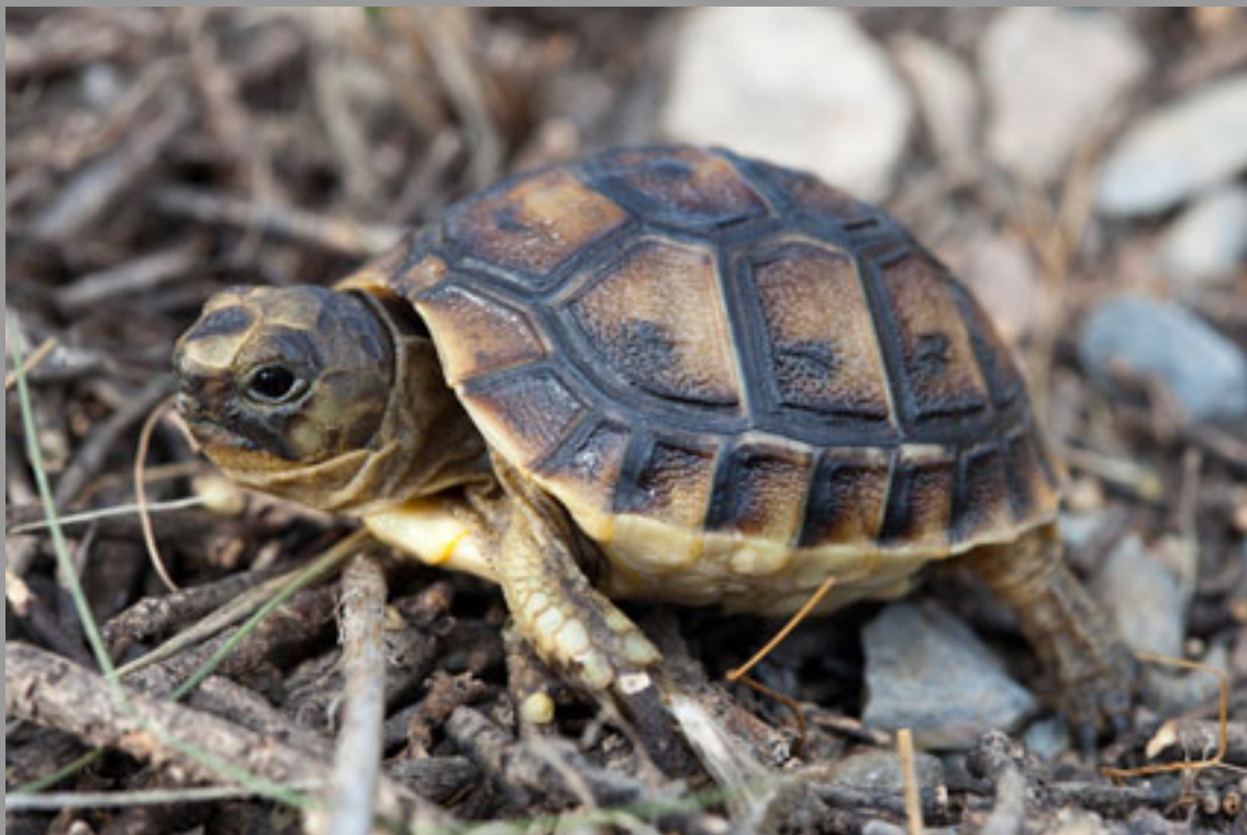
Testudo graeca , young