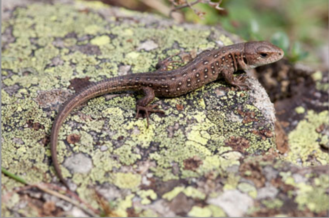
Lacerta agilis garzoni , young