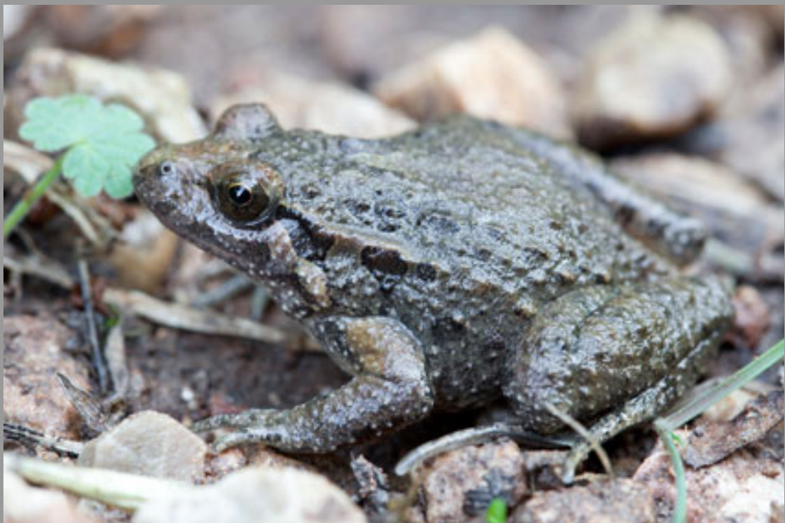
Discoglossus galganoi jeanneae