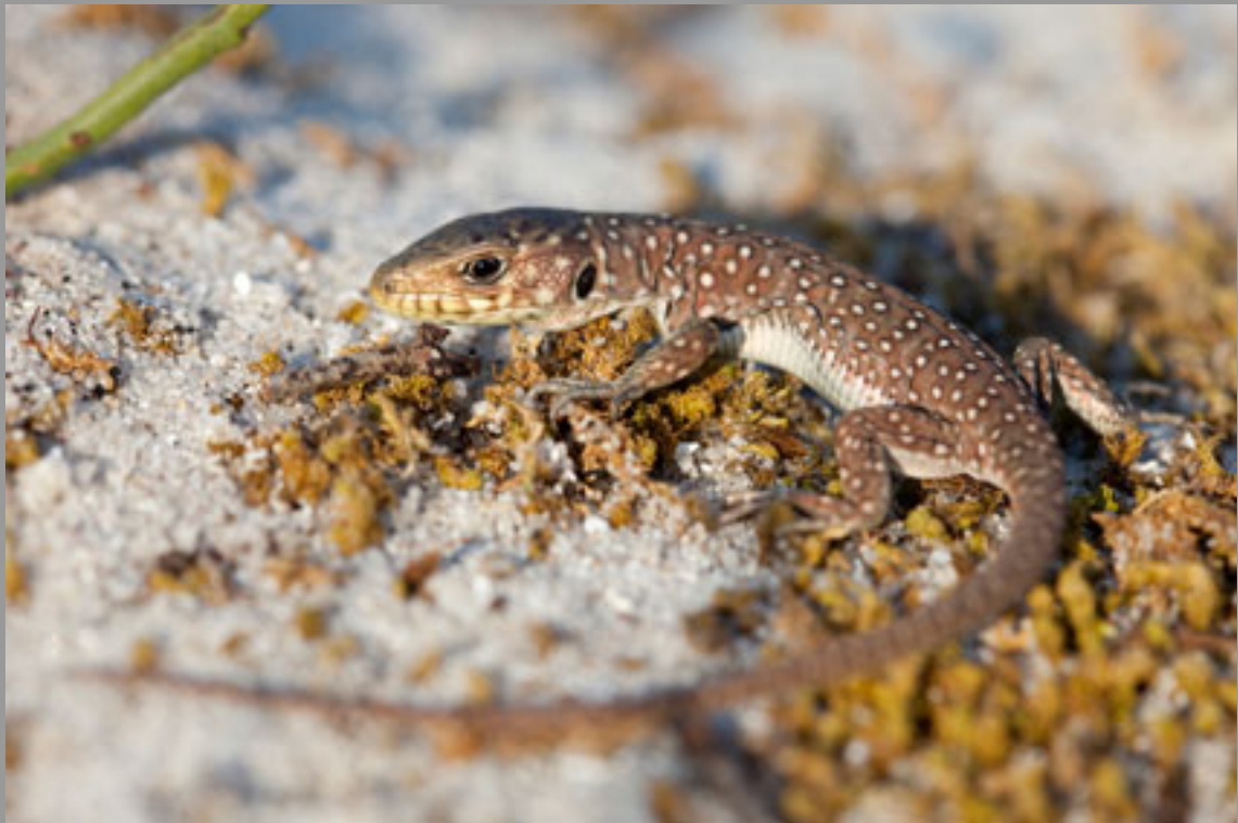
Timon lepidus ibericus , young