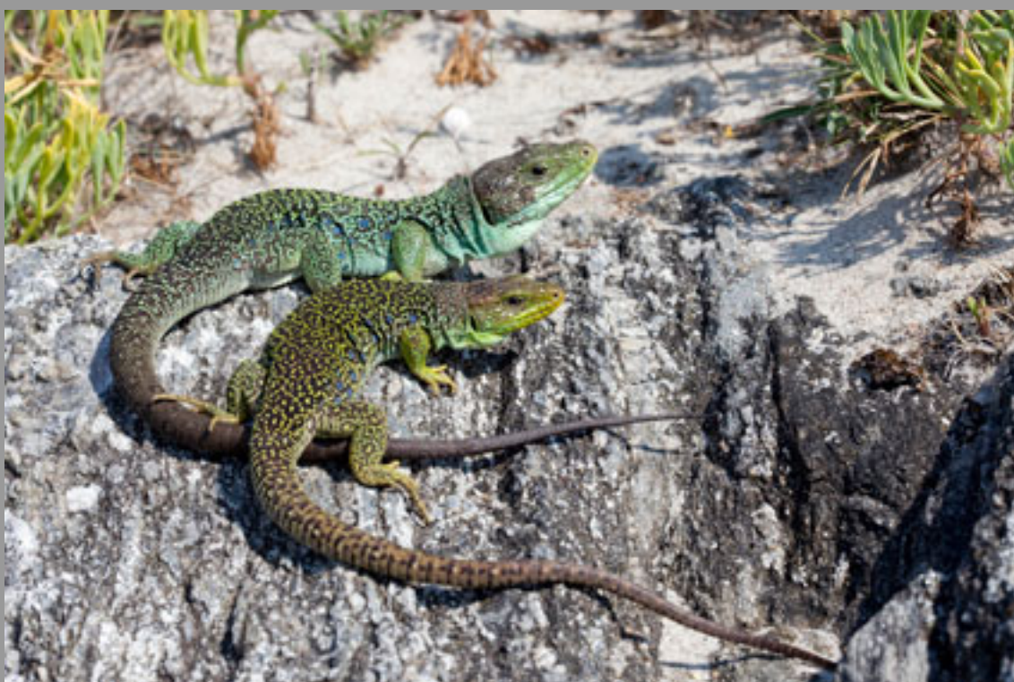
another female and a big male