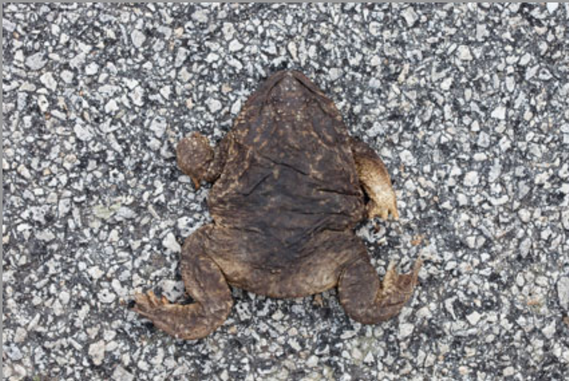
a large dry crepe of Bufo spinosus