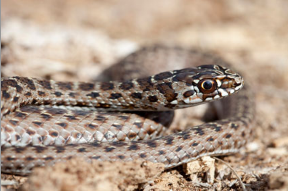
Malpolon monspessulanus , young female