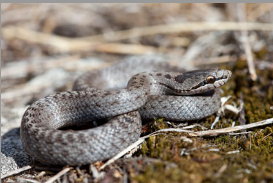
Coronella austriaca acutirostris , young