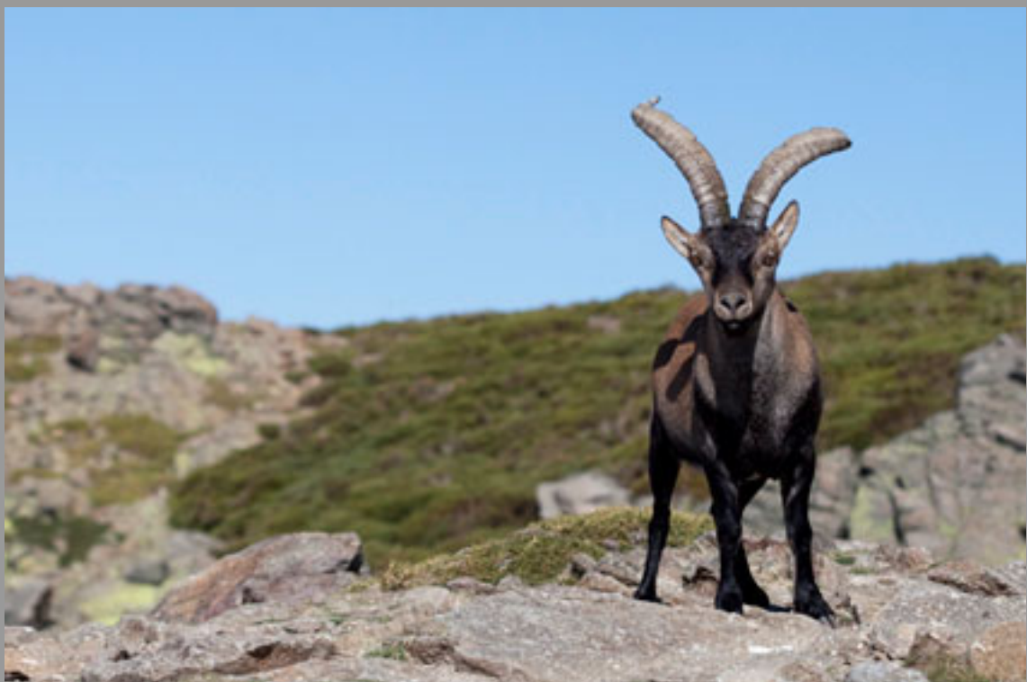
Capra pyrenaica victoriae , male