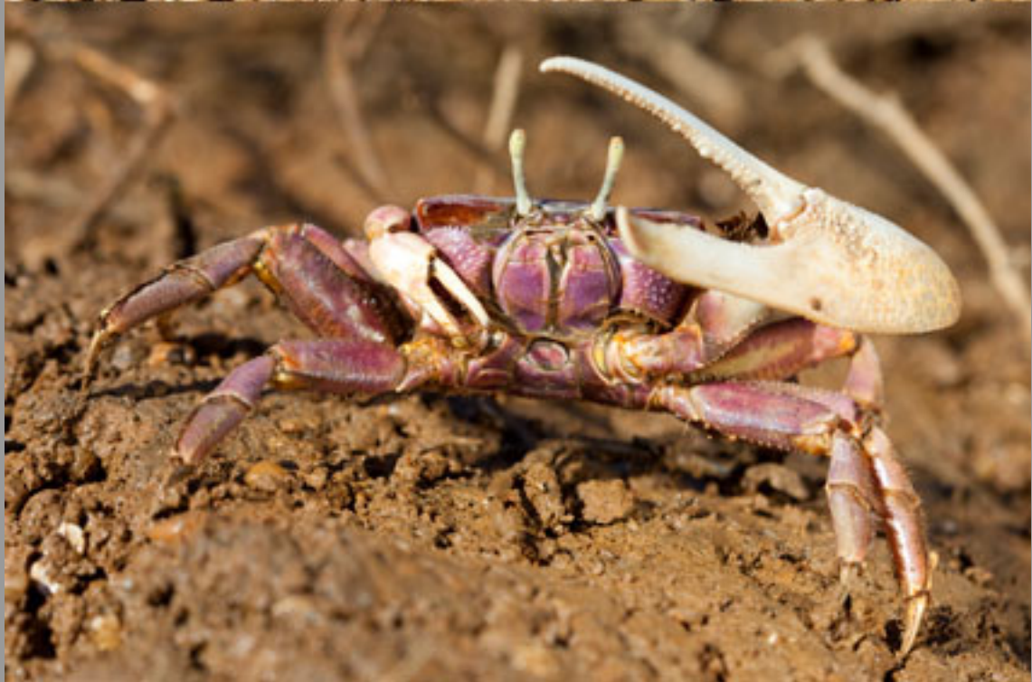
Uca tangeri , male