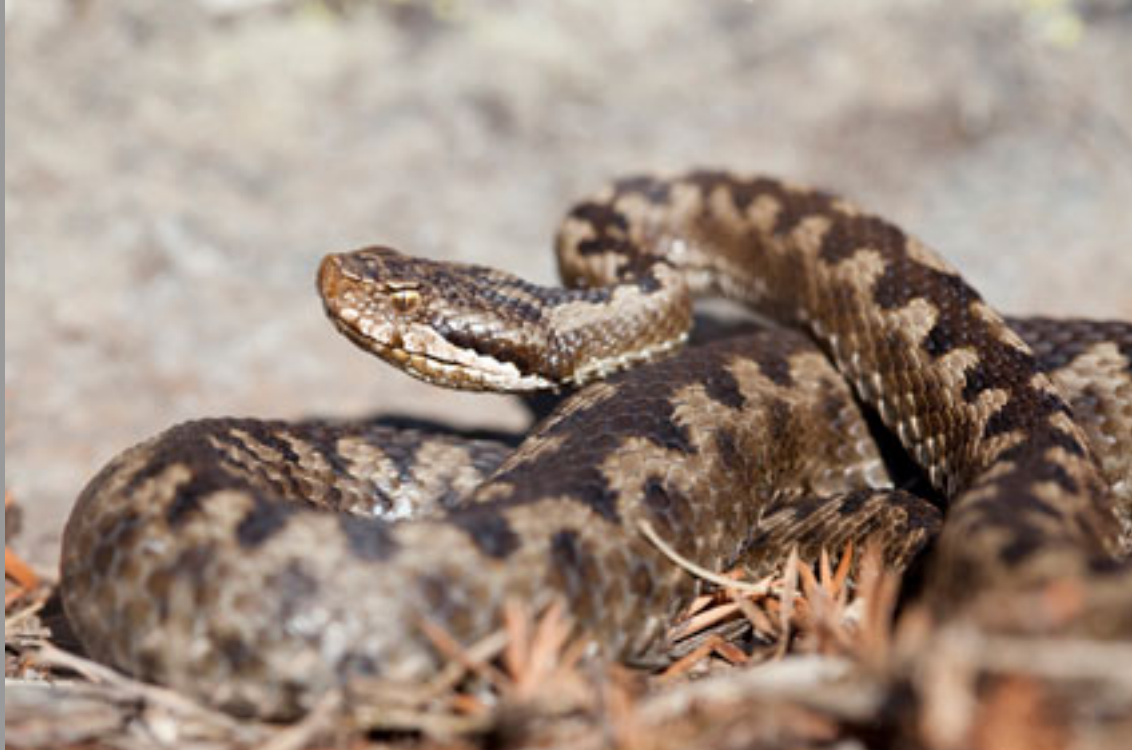
Vipera aspis zinnikeri