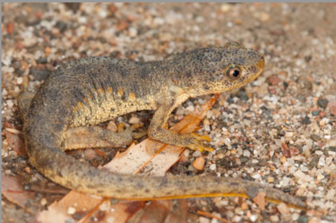
and another one