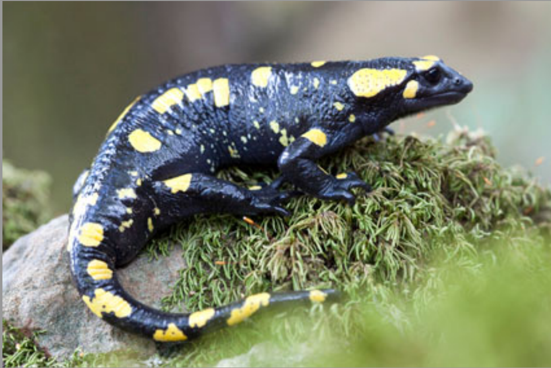
Salamandra salamandra longirostris

investigation gave another one, juvenile. Also Podarcis vaucheri (juv. & subad. only), Pelophylax perezi , Discoglossus galganoi jeanneae (juv.) and 2 very young D.O.R. Malpolon monspessulanus . The wanted Pelodytes ibericus stayed impossible to find.