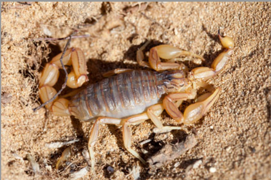
Buthus ibericus , where is the male ?!!