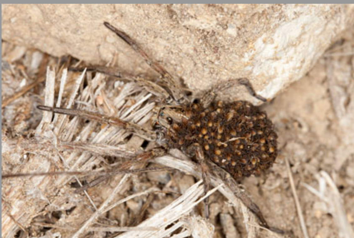
Hogna radiata ... and youngs !