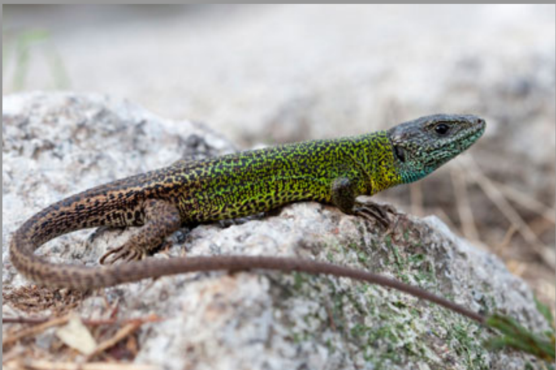
Lacerta schreiberi , male