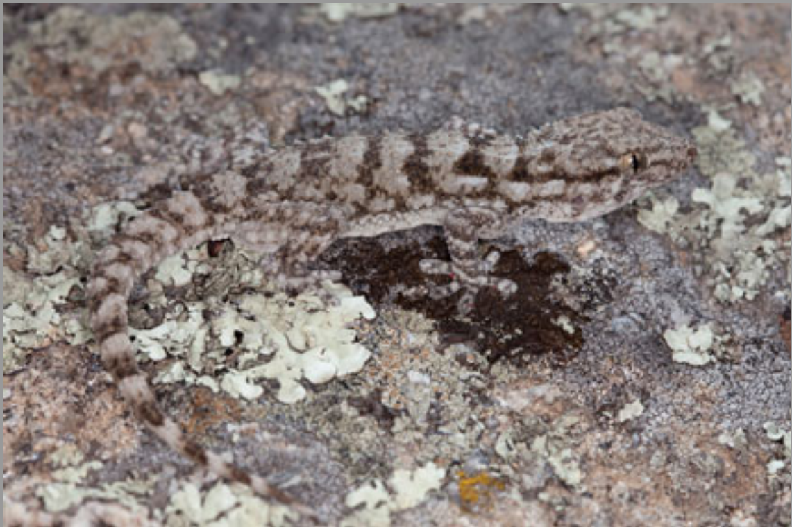
Tarentola mauritanica , young

A short stop in the night with only again Pelobates cultripes , Podarcis guadarramae guadarramae (juv.), Timon lepidus lepidus and Tarentola mauritanica . However I made a wonderful watching of a Small-Spotted Genet ( Genetta genetta ) on a tree next to the road.