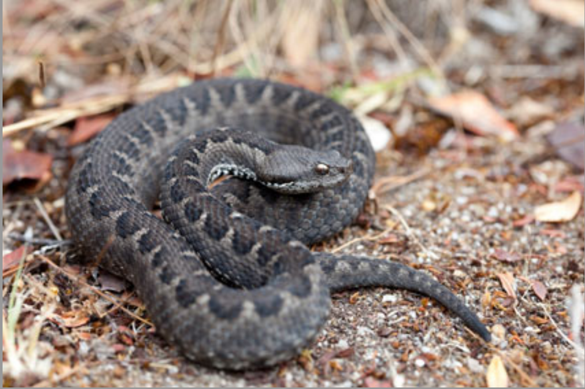
Vipera latastei latastei