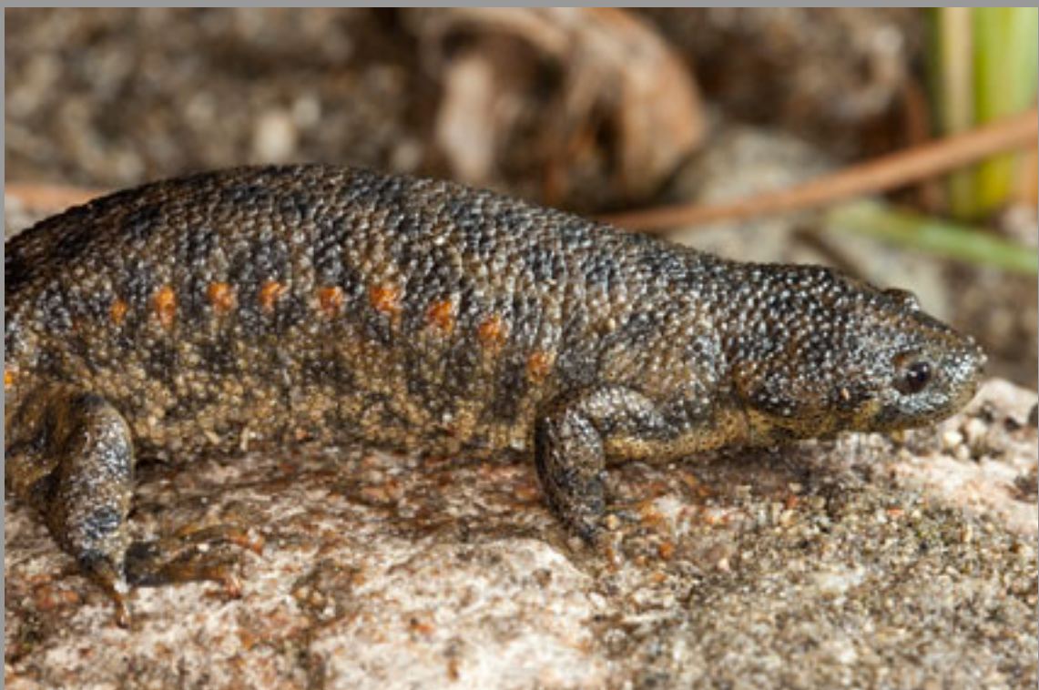
big Pleurodeles waltl