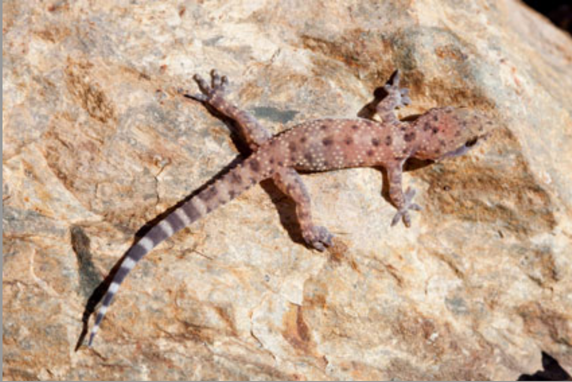
Hemidactylus turcicus , young

Only Natrix maura , plenty of young Hemidactylus turcicus and Hyla meridionalis .