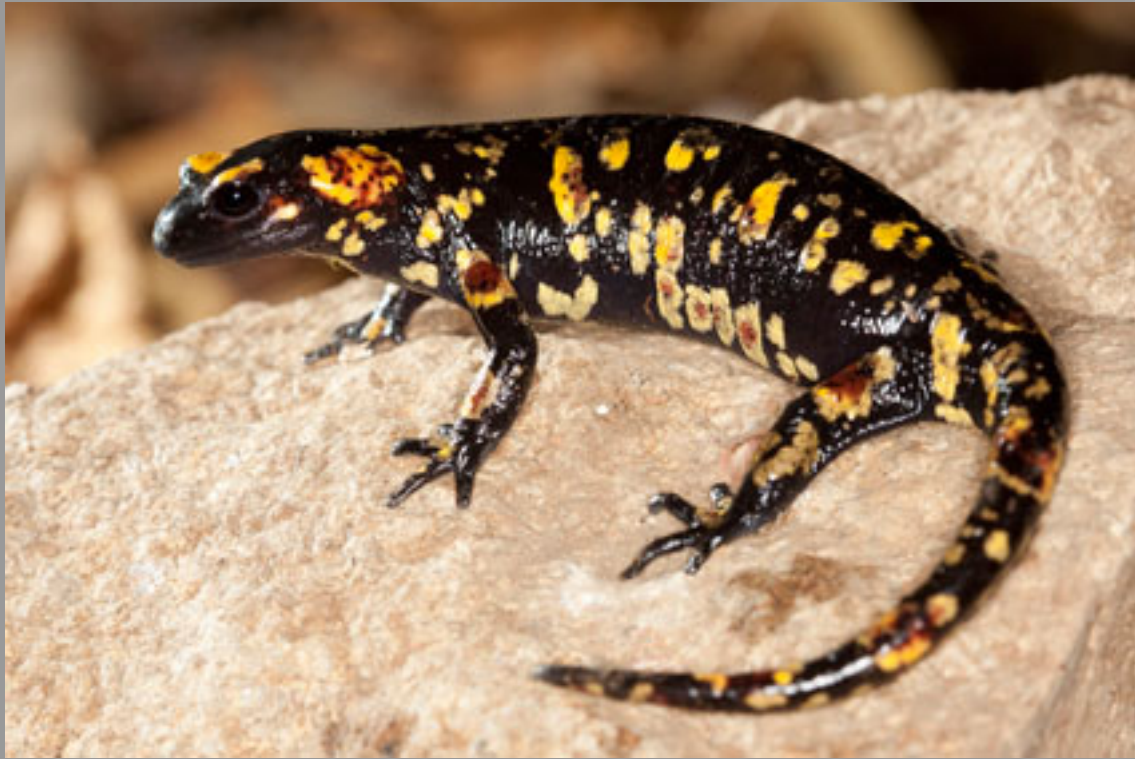
Salamandra salamandra crespoi