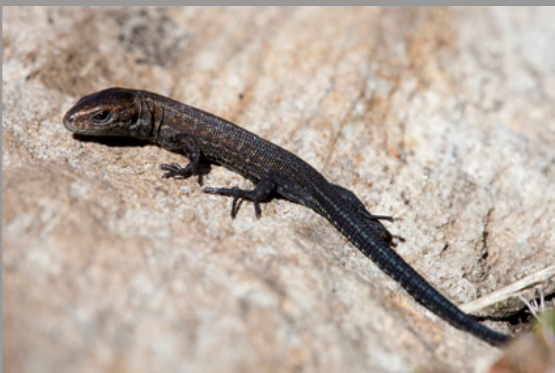
Zootoca vivipara lousilantzi , very young