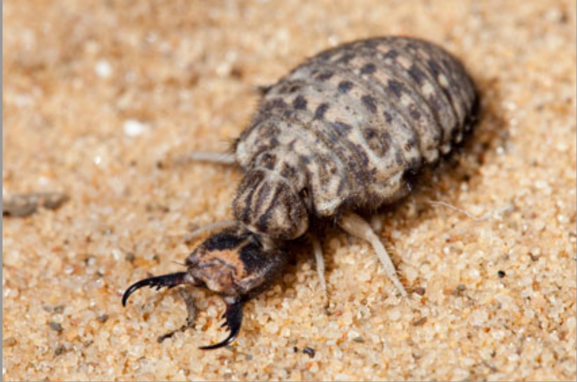
big larva of Myrmeleontidae