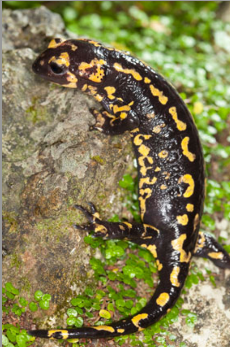
Salamandra salamandra gallaica