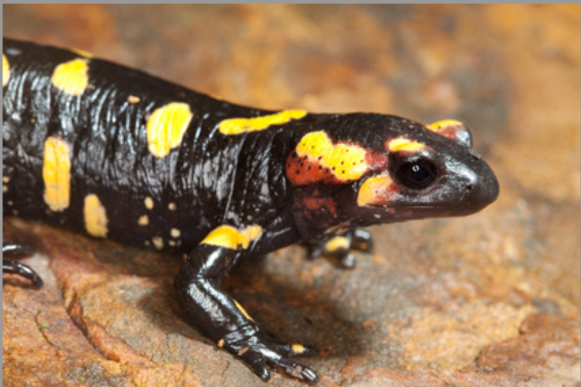
Salamandra salamandra bejarae

a little part of my collect on the road. Of course, I released them in a safe area