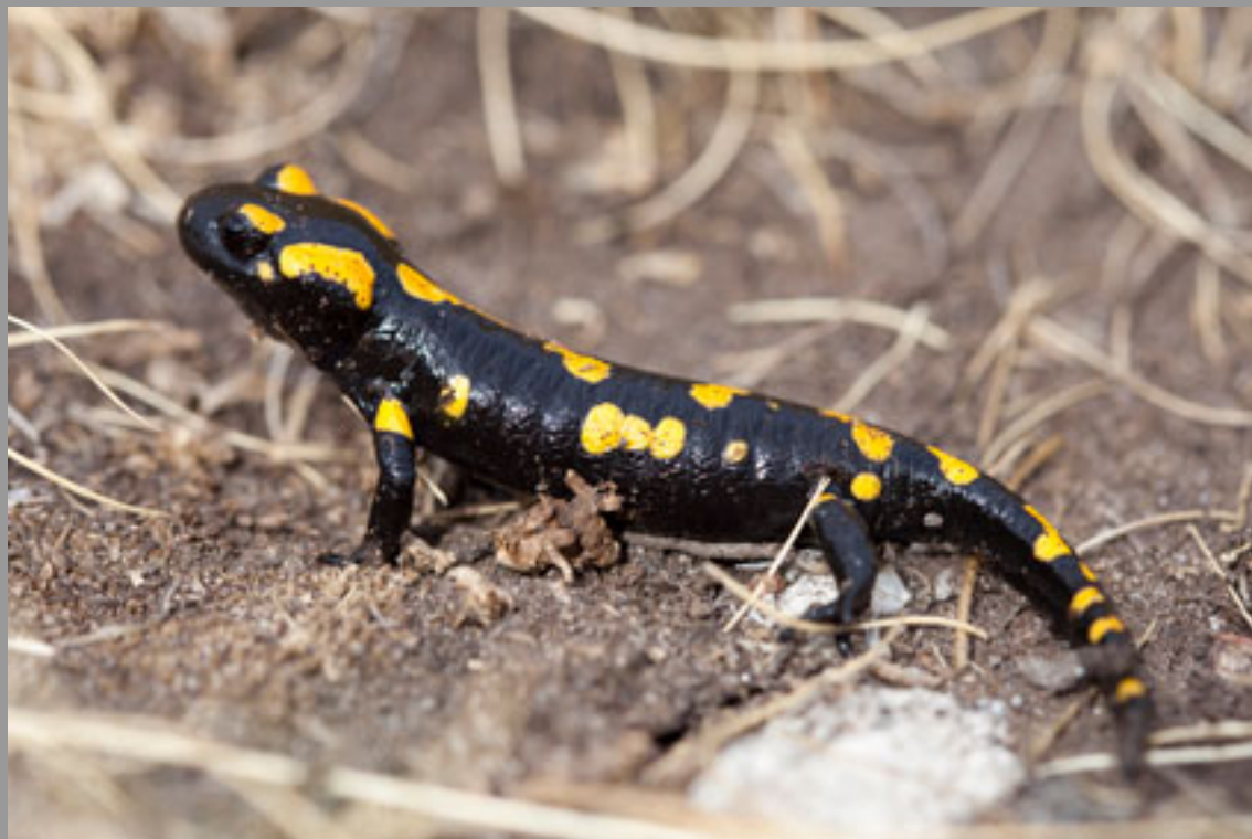
Salamandra salamandra almanzoris