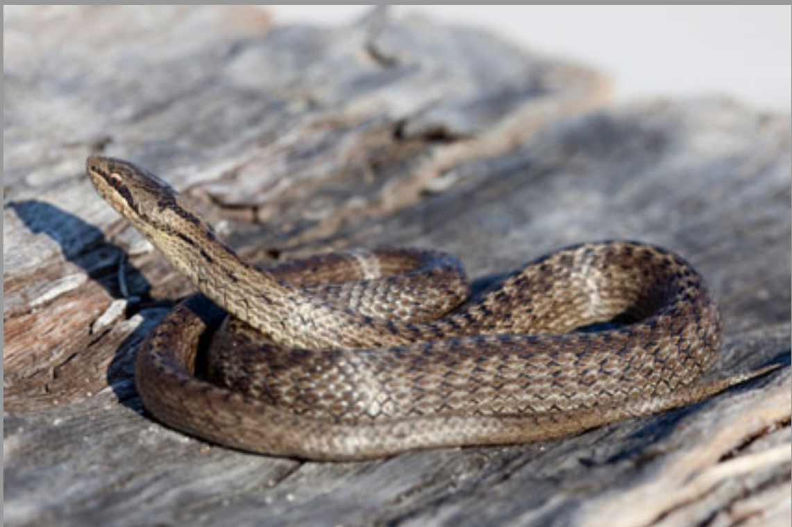
Coronella austriaca acutirostris