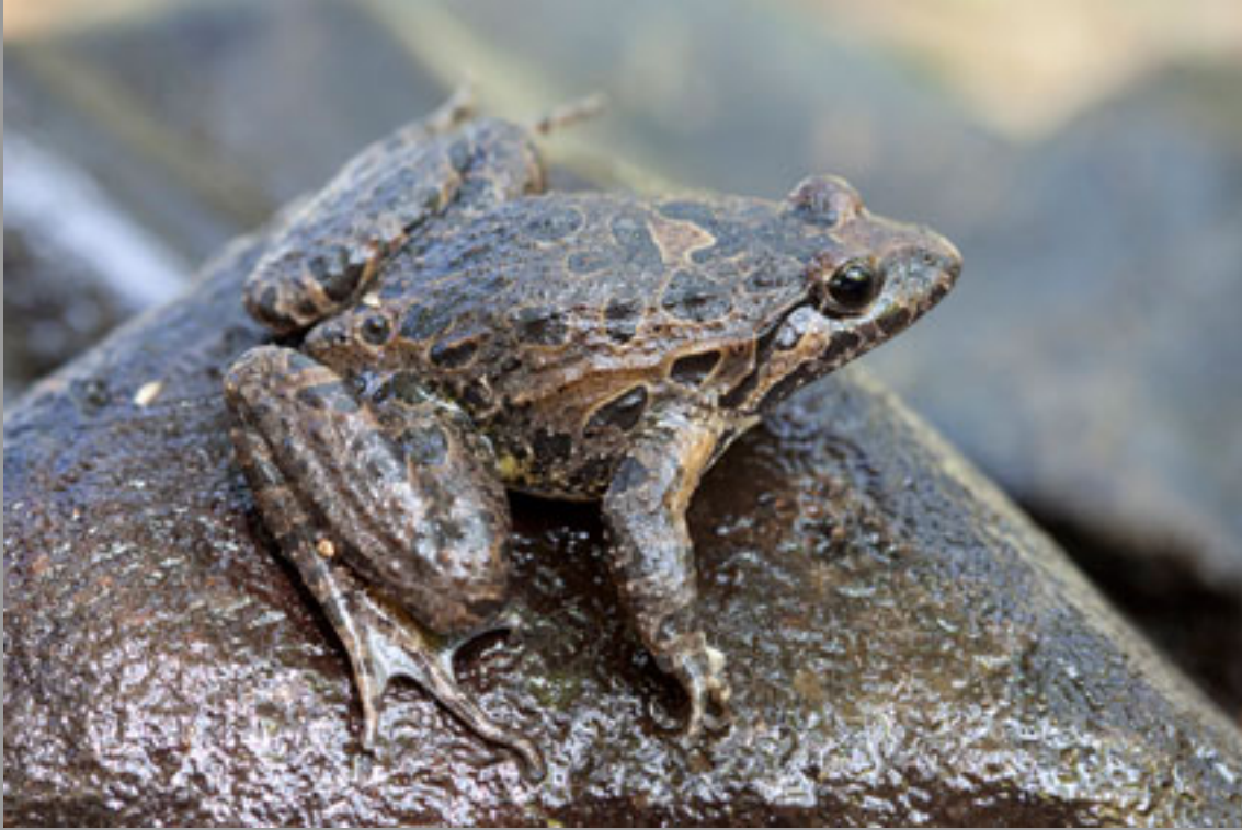
Discoglossus galganoi galganoi

Too dry here, the rain had not touched that area, and I failed to find Salamandra salamandra morenica . Next to a river, some Discoglossus galganoi galganoi .