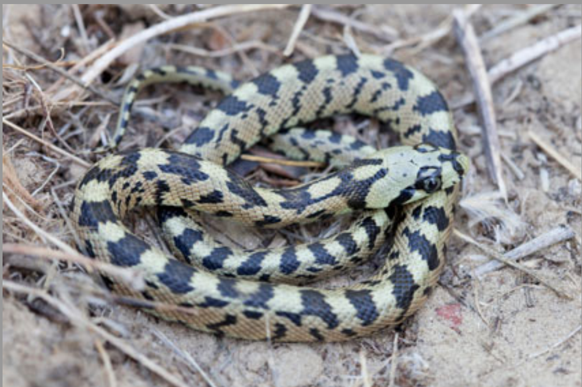
Rhinechis scalaris , young