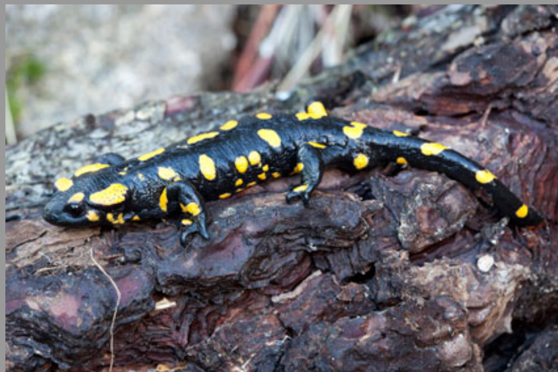
Salamandra salamandra bejarae

The next day, I left to France, but in the evening, I planned a short stop in the east part of Gredos for Salamandra salamandra bejarae , in a place where I spotted some larvae a few years ago. Still under the rain, I found quickly 7 big salamanders, very similar, on a small path. A nice end !