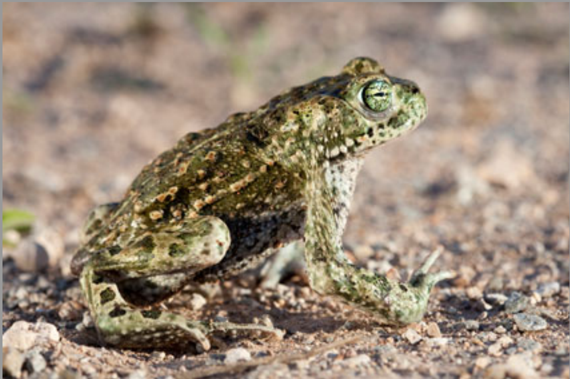
Bufo calamita very rickety