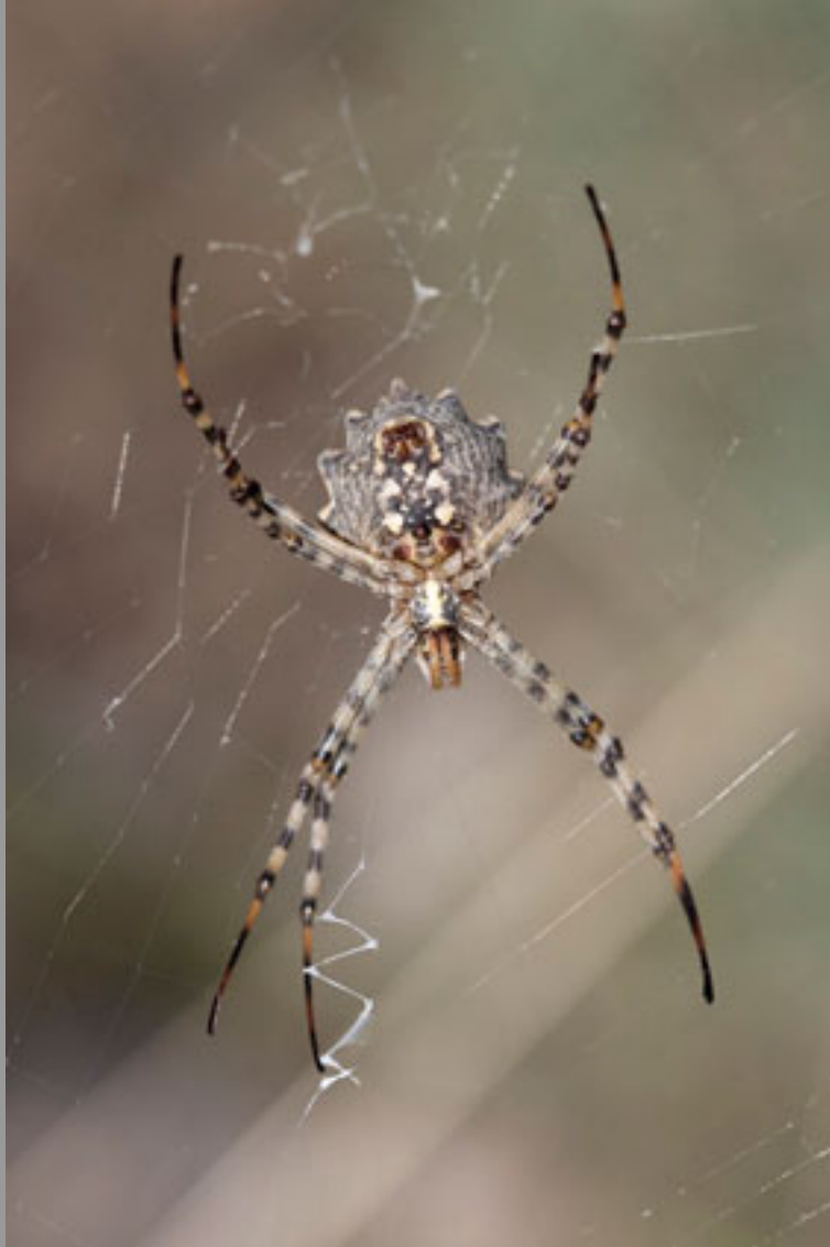
Argiope lobata , female