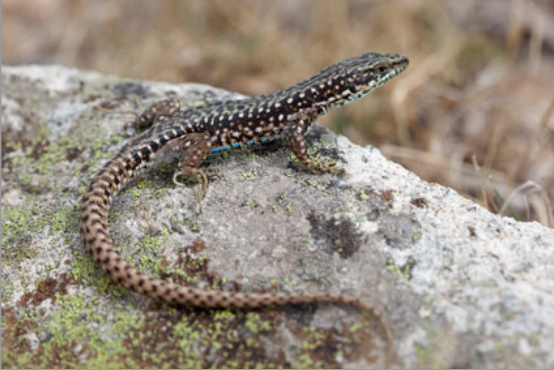
Iberolacerta cyreni cyreni

Iberolacerta cyreni cyreni was easily found, but under stones, cause the strong wind didn't allow the lizards to be outside. Also a single Podarcis muralis and a young Coronella austriaca austriaca .