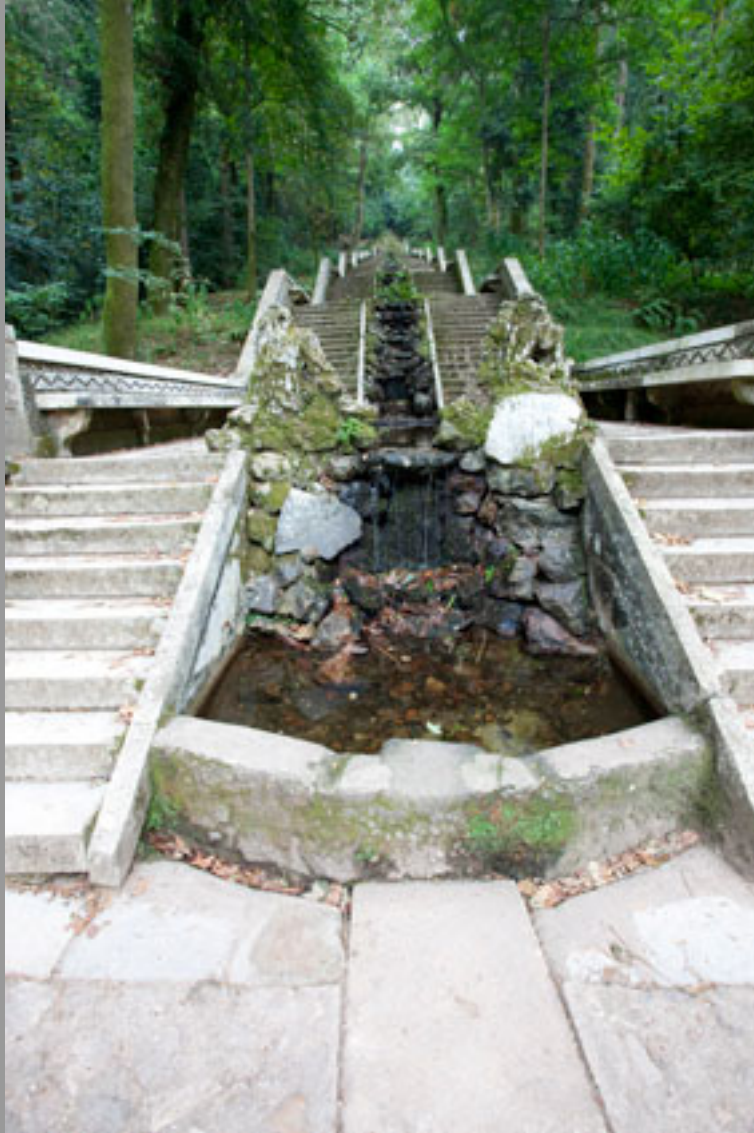
habitat of S. s. gallaica and Chioglossa l. lusitanica