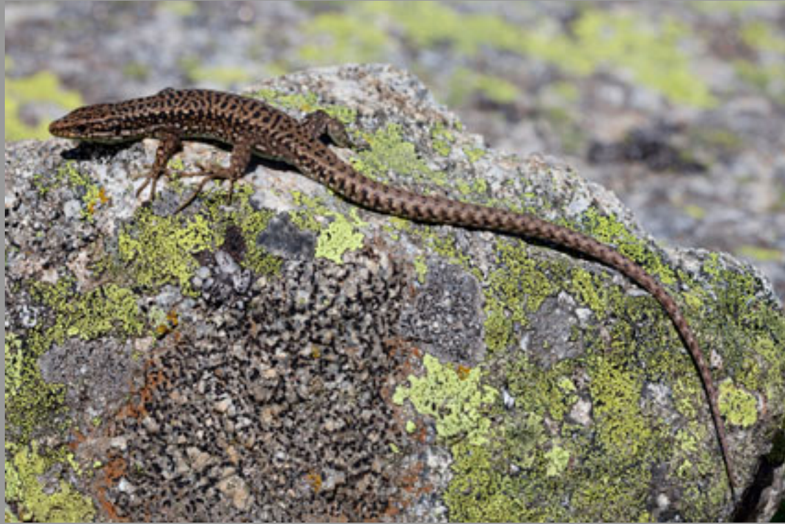
Iberolacerta cyreni castiliana