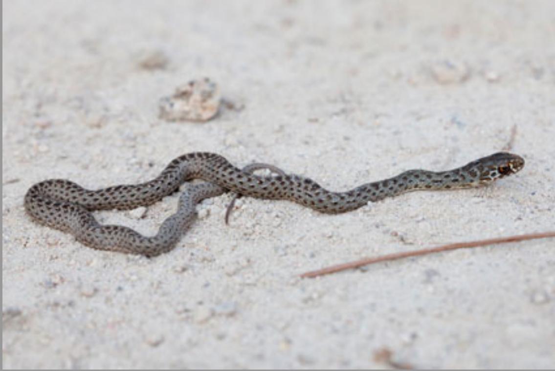
young Malpolon monspessulanus , probably female

impossible to find. In the same area I saw : Lacerta schreiberi (x12 juv. and adults), Psammodromus algirus , Podarcis bocagei , Podarcis guadarramae lusitanicus , Timon lepidus ibericus , Anguis fragilis , Natrix natrix astreptophora , Malpolon monspessulanus (juv.), Chioglossa lusitanica longipes and Rana iberica .