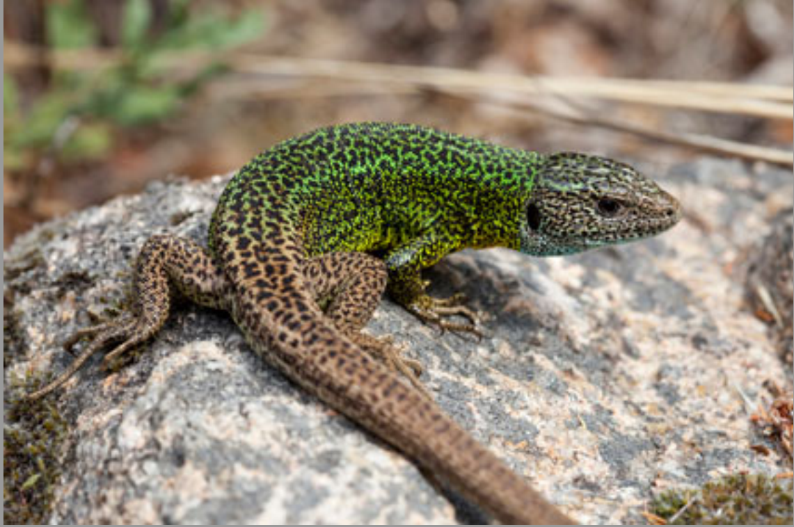
Lacerta schreiberi , male