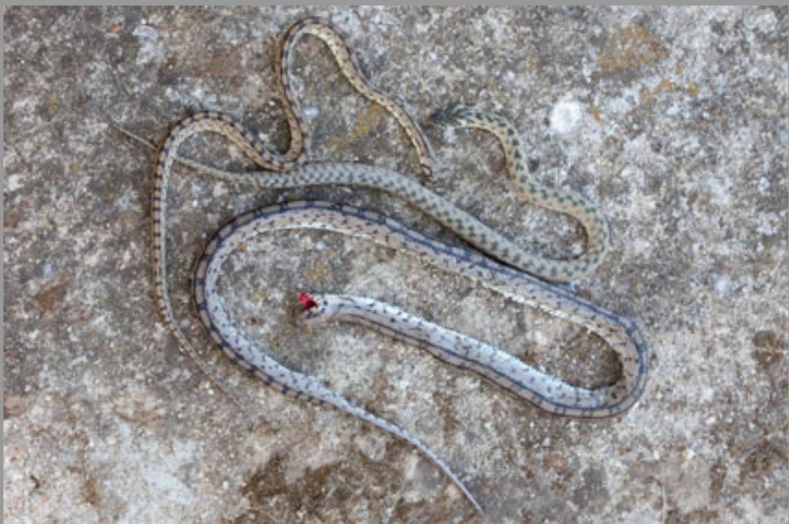
bad night for snakes... on 3 km only.