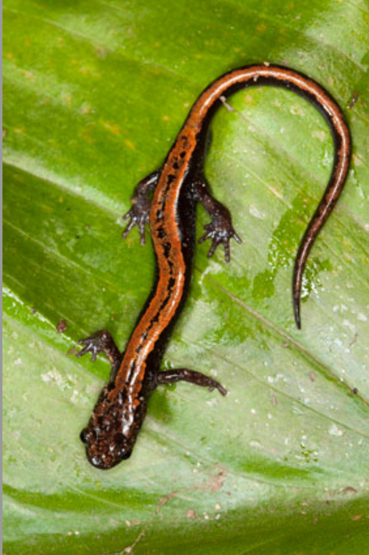
Chioglossa lusitanica lusitanica