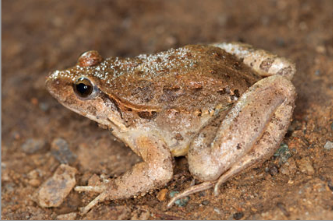
Discoglossus galganoi galganoi