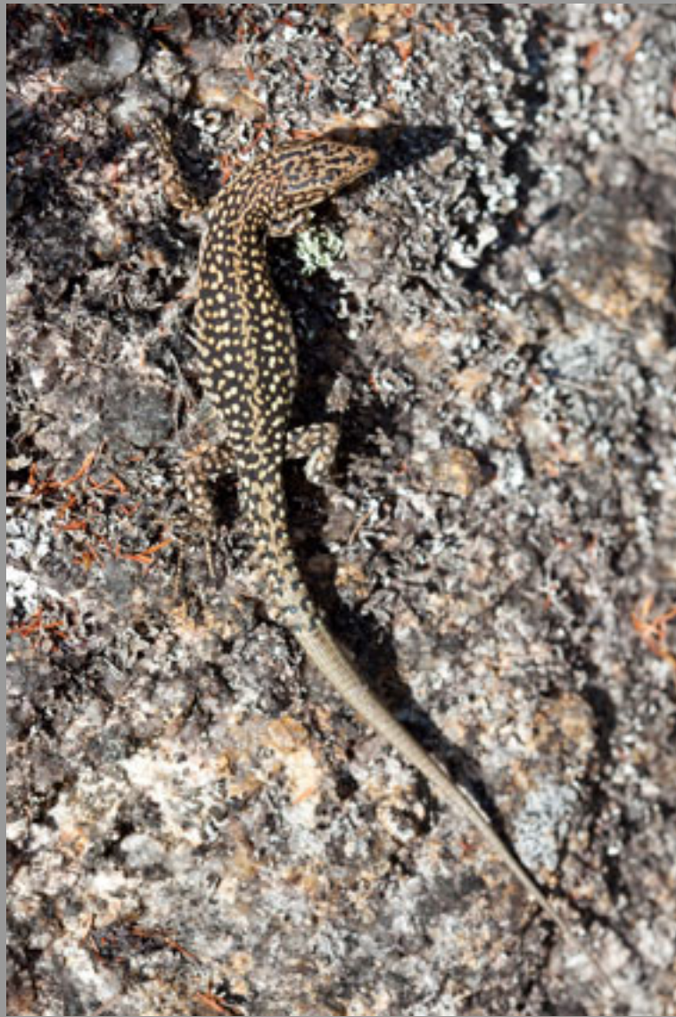
Podarcis guadarramae lusitanicus