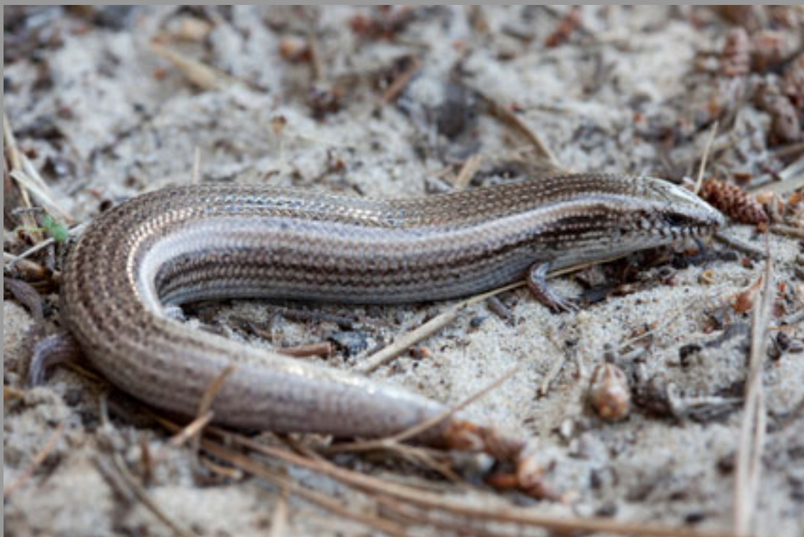
Chalcides bedriagae cobosi