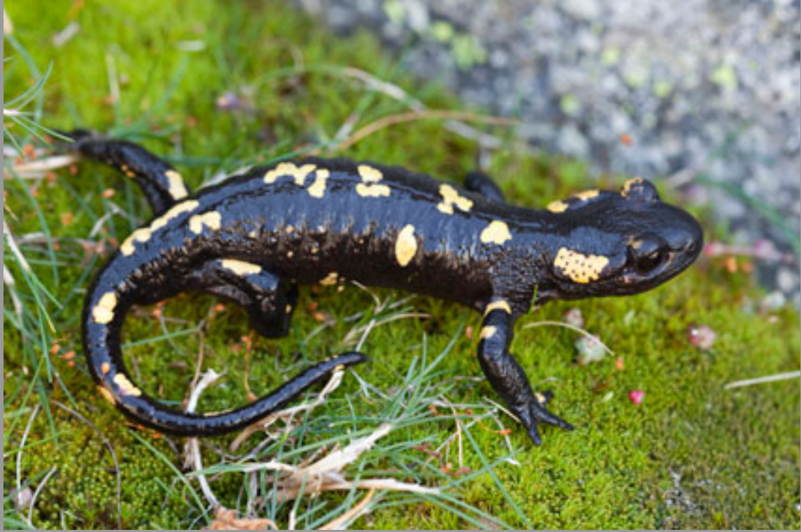
Salamandra salamandra almanzoris