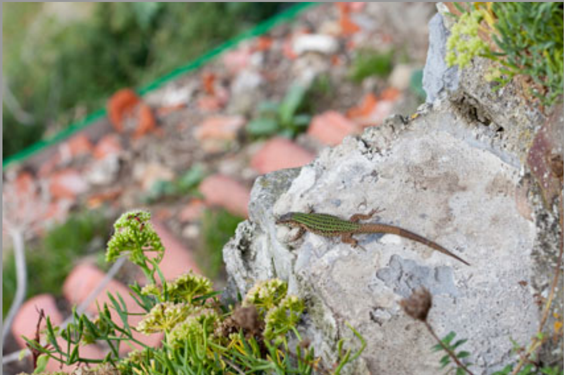
Podarcis pityusensis pityusensis