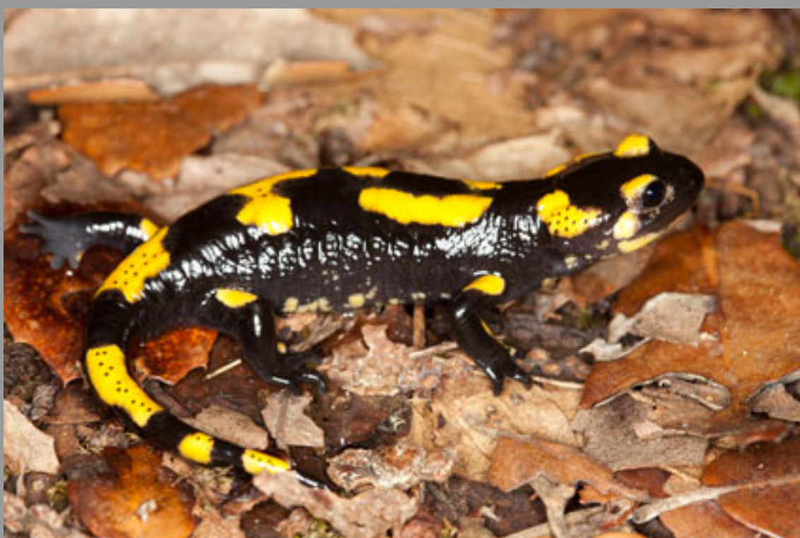
Salamandra salamandra terrestris