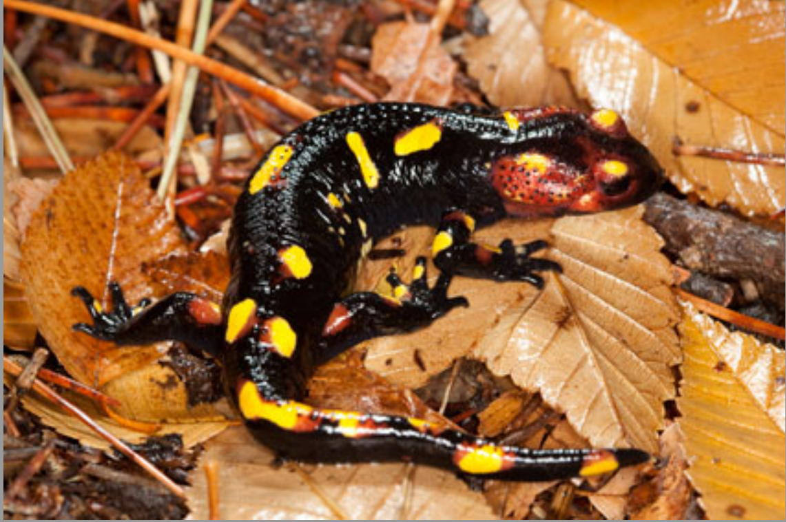
Salamandra salamandra morenica