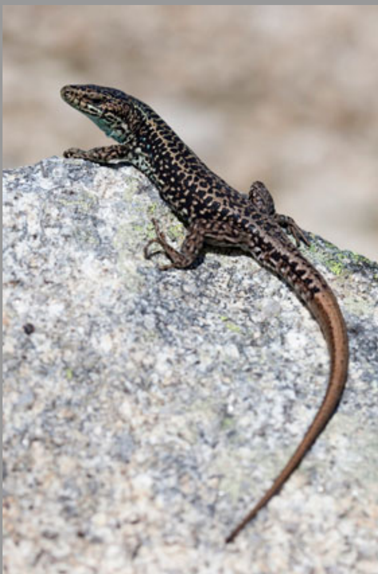
Iberolacerta monticola monticola

The target here was Iberolacerta monticola monticola . A strong wind blew in the valley and hope was very low. In the morning all lizards were hidden, but I found the first adult specimen under the first stone ! In the afternoon, a few lizards were surprisingly outside.