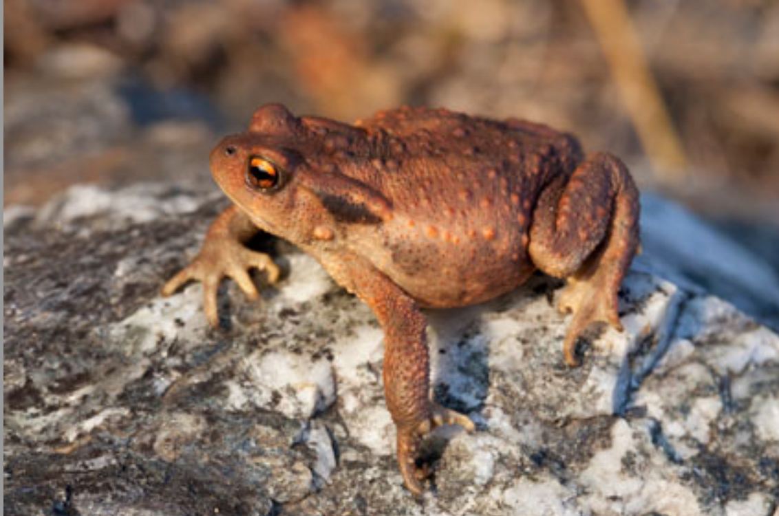
Bufo spinosus , young