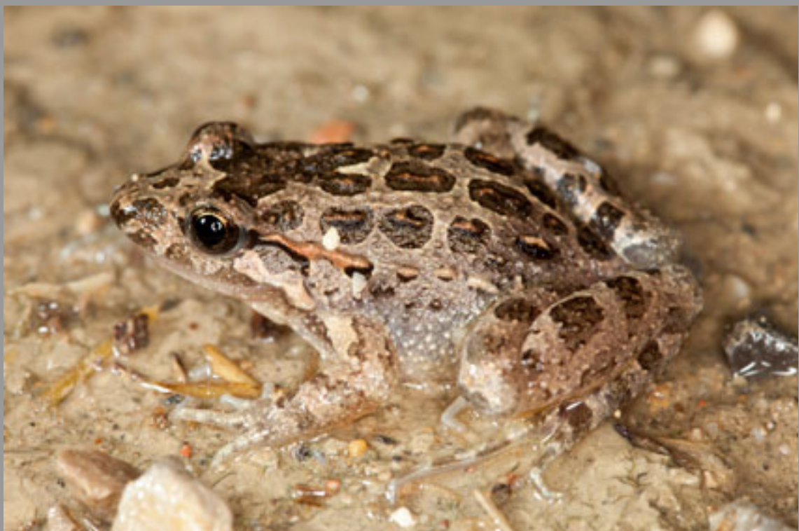
Discoglossus pictus pictus