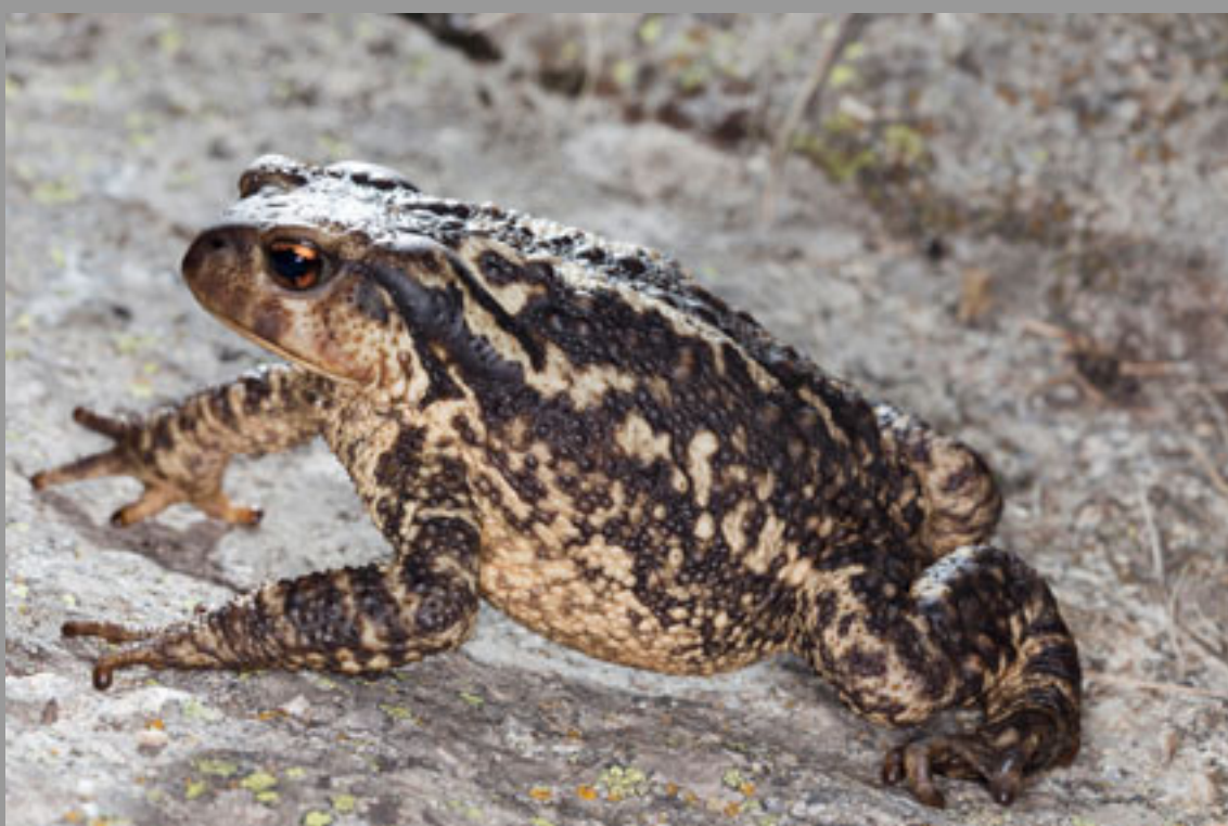
Bufo bufo gredosicola