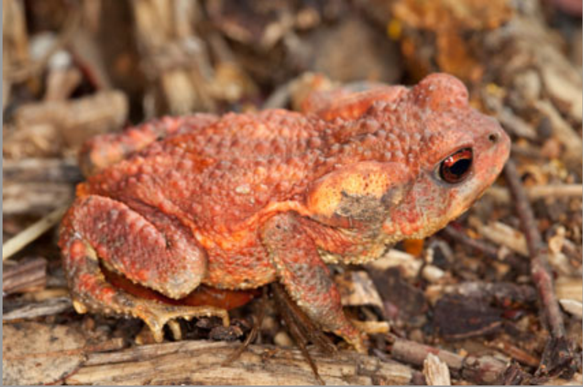
a redish young Bufo spinosus