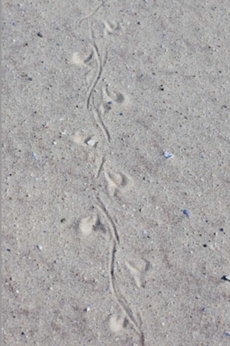
trails in the sand ( Timon lepidus )