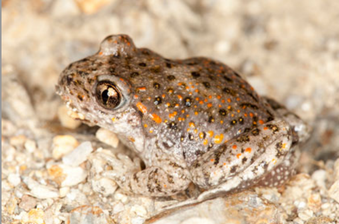
Alytes obstetricans boscai