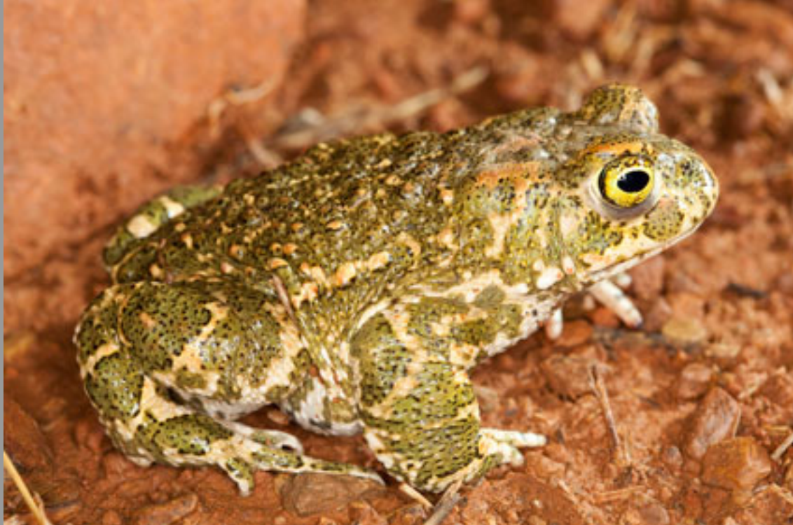
Bufo calamita alive ! male