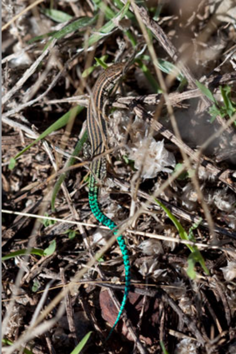
Podarcis hispanica , juvenile with a fluo tail