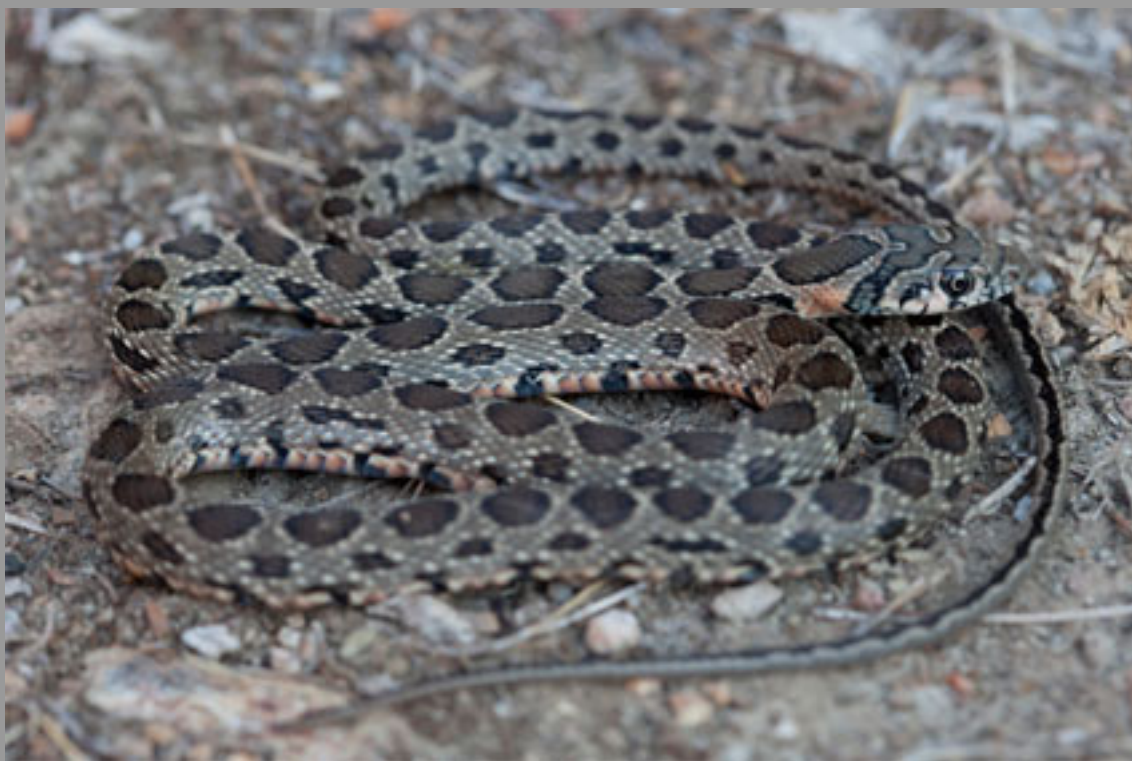
Hemorrhoids hippocrepis , young