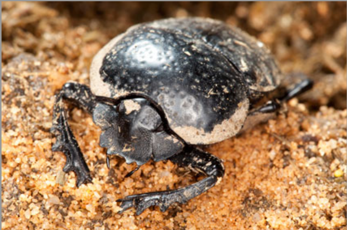
Scarabaeus cicatricosus , very common